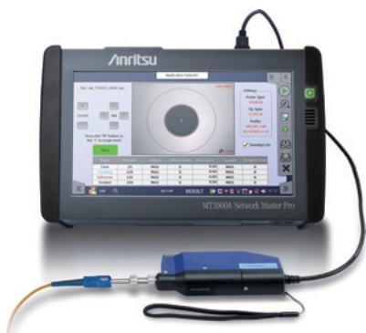
Available for MT1000A and MT1100A *Shown with MT1000A